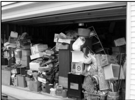
FIGURE 1 - PACK-RAT GARAGE 19

It used to be that the garage was a place to park the car and do the laundry. Dad would have his workbench and tools and the kids would store their bicycles and other outdoor playthings. Yet, few people actually park their car in the garage. Why? The garage has become the ultimate storage room for everyone’s junk. Just look at the picture below for an example. This is bad but I’ve seen much worse. When I walk to the office, I walk through an older residential area and I’m constantly amazed at how much stuff accumulates in people’s garages. There are several that are literally stacked floor to ceiling with junk.