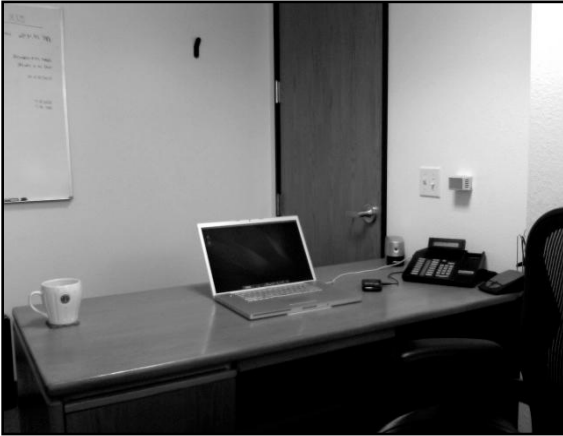
FIGURE 4 - CLEAN DESK