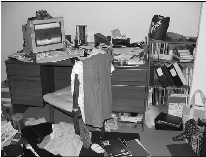
FIGURE 3 - MESSY DESK 21

Attack your filing cabinets. Only keep the essential paperwork. Chuck those old instruction manuals for equipment you no longer own. Toss old articles, lease agreements from an old address, and credit card statements from years past. Unless you run a small business and need to keep every scrap of paper for legal and tax reasons, there's no need to hang on to so many documents. When you're done, your desk could look like the one shown in Figure 4 (that's my office desk.)