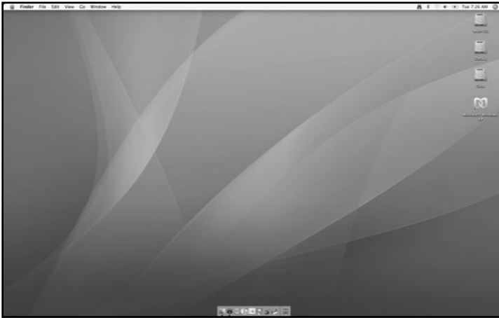
FIGURE 6 – UNCLUTTERED DESKTOP

Another thing to look at is the amount of music, video and photo files. These can take up tens, if not hundreds of gigabytes. Storage space is very inexpensive, but these files are a form of clutter. Clutter is clutter whether it's a physical item or a bunch of bits and bytes stored on a computer.