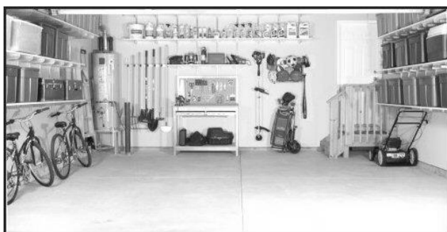
FIGURE 2 - CLEAN GARAGE 20

Once you're done, maybe your garage will look like this: